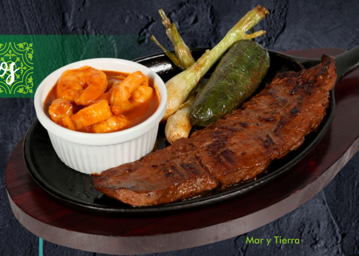
Mar y Tierra

Enchiladas $16.50 3 chicken Tinga or cheese enchiladas in your choice of salsa (Red, green or mole) topped with sour cream & cheese. Served with rice, beans, & salad.