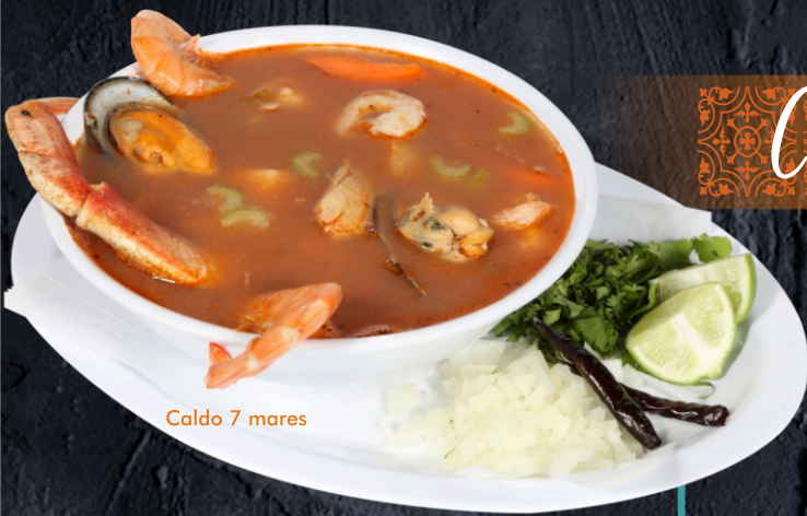
Caldo 7 mares