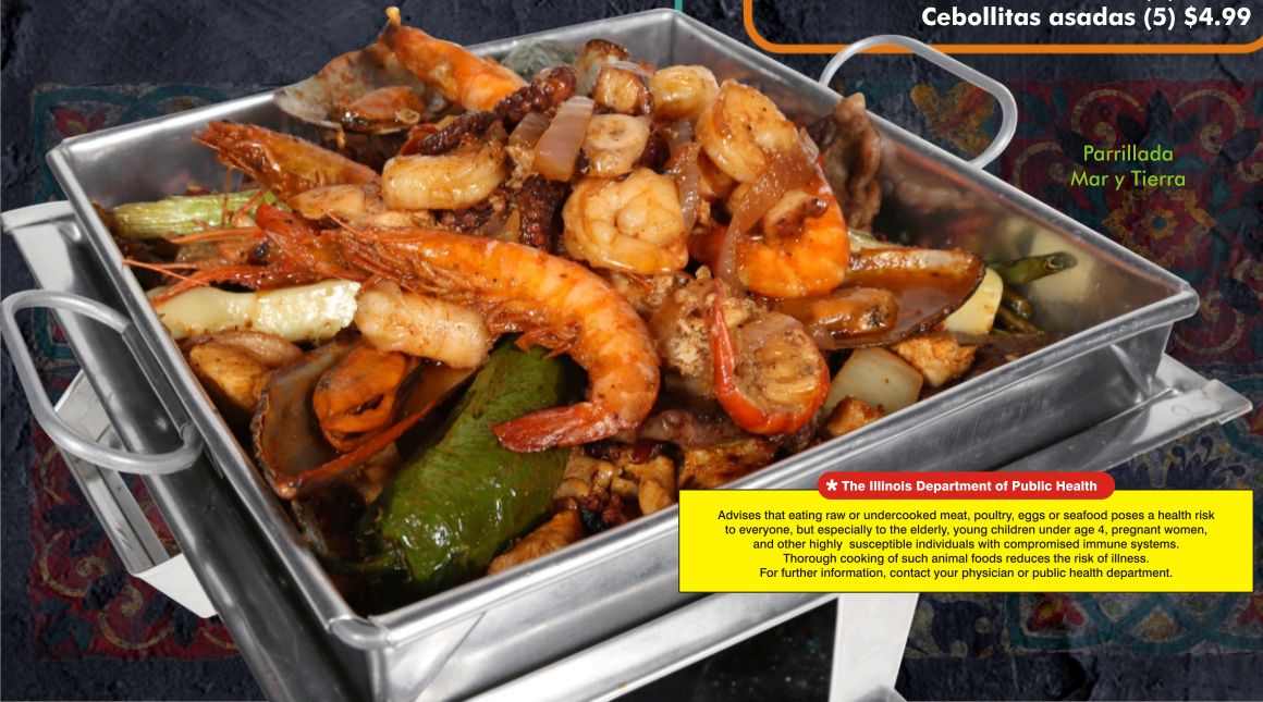
Parrillada Mar y Tierra

* The Illinois Department of Public Health