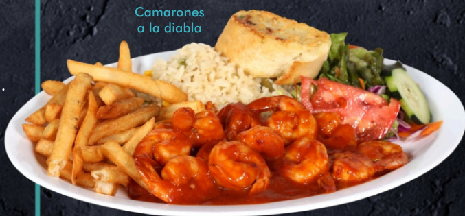
Camarones a la diablo