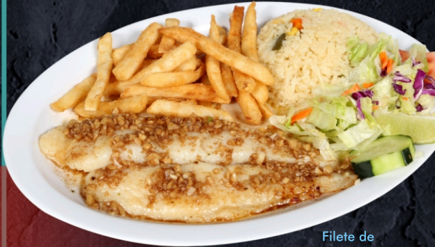
Filete de pescado